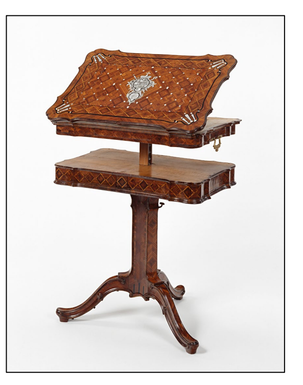
Image available under Getty's Open Content Program. Reading and Writing Stand (about 1760-65) by Abraham Roentgen. The J. Paul Getty Museum, Los Angeles